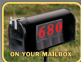
ON YOUR MAILBOX