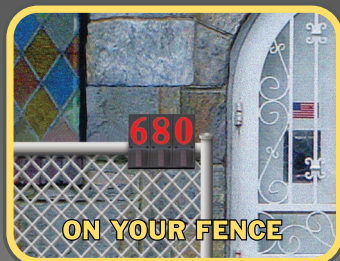
ON YOUR FENCE